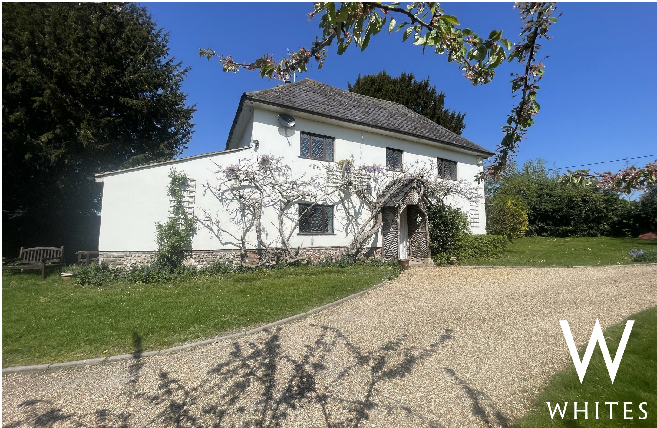
Primrose Cottage, Netton, Salisbury, Wiltshire, SP4 6AW